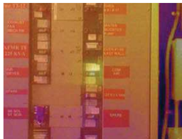
50 % blending