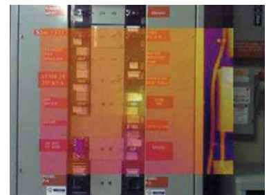
50 % blending, picture-in-picture mode