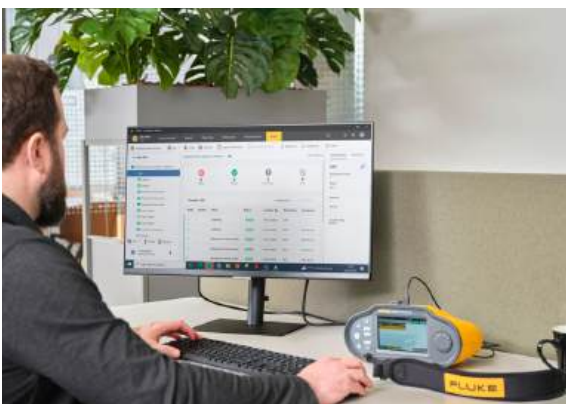
TruTest Software simplifies electrical system data management and reporting

The Fluke 1674 FC includes a patented Insulation PreTest, so you can better protect the installation and avoid costly mistakes. If the tester detects that appliances are connected to the system during the test, it will stop the insulation test and provide a visual and audible warning. This helps eliminate accidental damage to peripheral equipment and saves you both time and money.