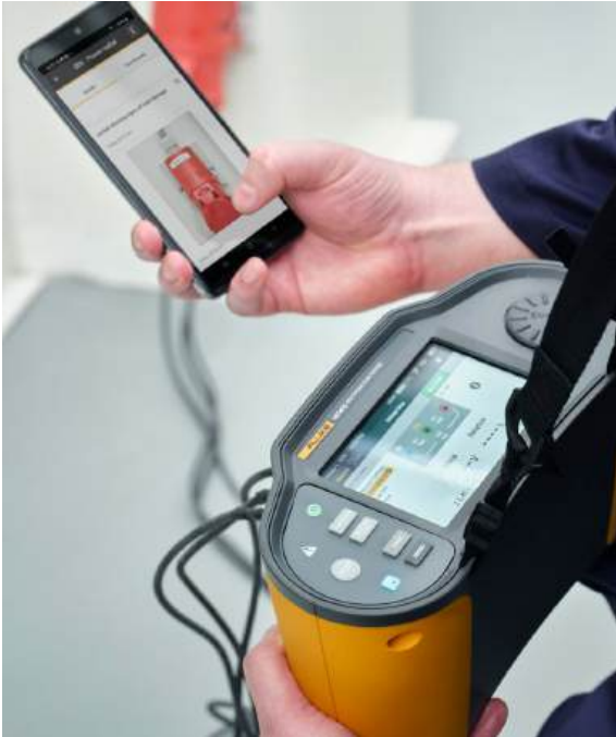
Assign photos directly to specific test points for more detailed documentation