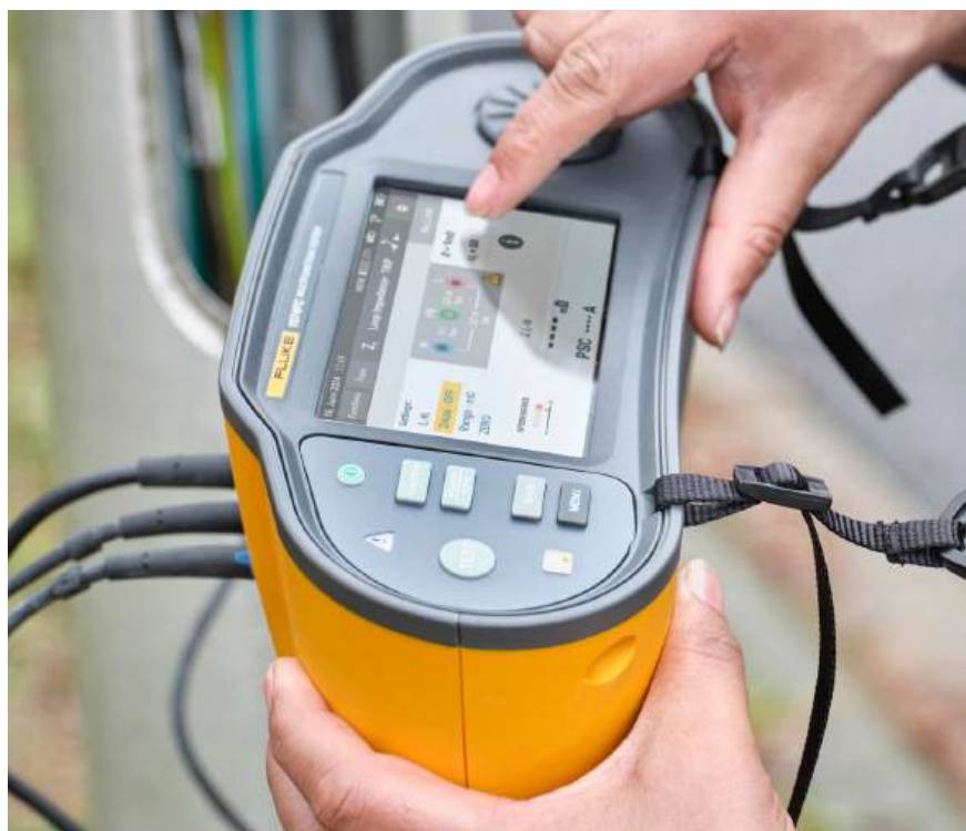
Full-color touch screen and tactile rotary knob for fast navigation

Simplify report generation with automatic report population, Fluke Connect integration, and one-touch reporting with Fluke TruTest™ software.