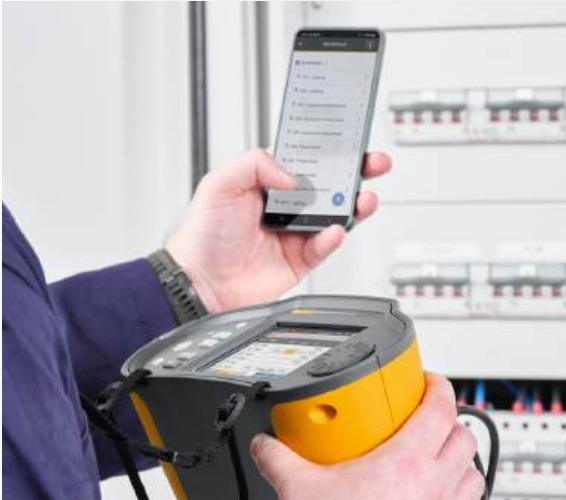
Reduce manual data entry and recordkeeping