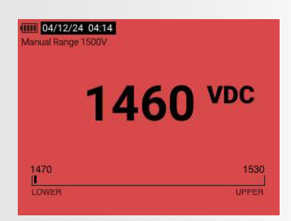
Limit gauge - outside of range