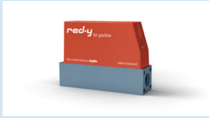
smart meter GSM Thermal mass flow meter