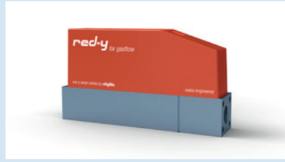
smart controller GSC Thermal mass flow controller