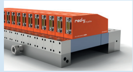
OEM version For customer-specific requirements