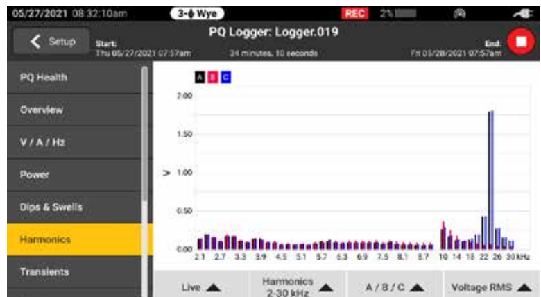
A full range of harmonics are available from the first 50 integer harmonics and from 2 kHz to 30 kHz

The Fluke 1770 Series was designed to be safe and easy to use in any measurement environment. The 1770 Series allows you to capture a full range of power quality variables as well as high-speed waveforms, high-speed transients, and higher frequency harmonics, all of which are instantly viewable on the large, high-resolution screen. With a best-in-class CAT IV 600 V / CAT III 1000 V overvoltage rating, these analyzers can be used at the service entrance or downstream, measuring AC and DC inputs, and harmonics measuring up to 30 kHz. With the 1770 Series you can be confident that you'll capture the data you need to make better maintenance decisions no matter the task.