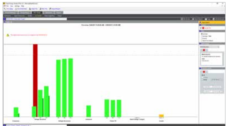
Fluke Energy Analyze Plus: Power quality health summary