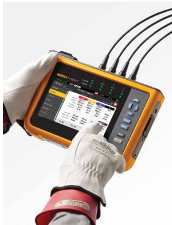
Easily navigate using the large color touchscreen

When downloading data from the Fluke 1770 Series Power Quality Analyzers the included Energy Analyze Plus software package can compare measured voltage and current harmonic statistical data to different standards, like EN 50160 or IEEE 519, to determine if they exceed compliance limits. This powerful predictive maintenance feature enables current harmonics to be observed before distortion appears in the voltage allowing you to prevent unexpected failures or non-compliance situations and increase system uptime. With the proliferation of inverter-based loads and power generation, keeping current harmonics in check is becoming increasingly critical to ensure reliable power quality and avoid system downtime.