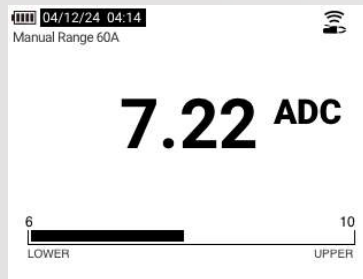
Limit gauge – within range

The CAT III 1500 V/CAT IV 1000 V rated 283 FC multimeter and a283 FC wireless current clamp meet the safety requirements for test equipment (IEC 61010-2-032) corresponding to the overvoltage category level of the PV array electrical installation (IEC 61730-1). Combine these with CAT III 1500 V/CAT IV 1000 V rated TL175-HV Premium Silicone Test Leads, CAT III 1500 V MC4 connectors and you've got a comprehensive frontline troubleshooting solution that offers safe and accurate voltage measurement for troubleshooting everything from the inverters, combiners, strings of modules, or individual modules.