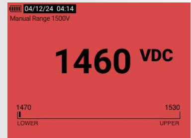
Limit gauge – outside of range