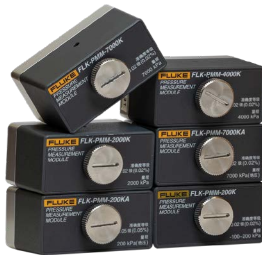
Figure 1. Rechargeable lithium battery with capacity indication.

HART communication enables mA output trim, trimmed to applied values, and pressure zero trimming of HART pressure transmitters. You can easily change a transmitter tag, measurement units and ranges. Other supported HART commands include setting fixed mA outputs for troubleshooting, reading device configuration parameters and reading device diagnostics.